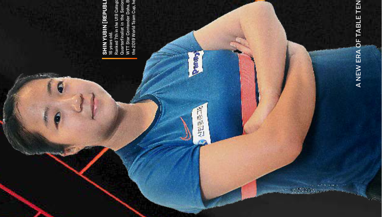
SHIN YUBIN [REPUBLIC OF KOREA]